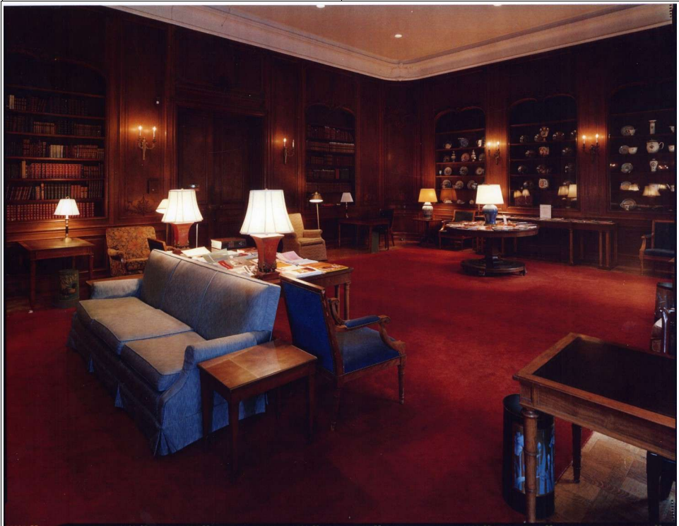
The members' room at NYSL.

The wonderful testimonials to the library, many written by some very famous members! They're posted on the library's website at www.nysoclib.org/testimonial.ht ml