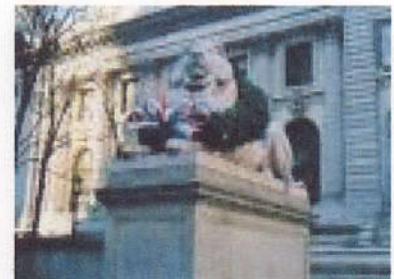
Patience (certainly it couldn't be Prudence, could it?!) tarts it up in Bryant Park