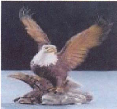
Nope, the bald eagle story was true. The question of "why?" has not been answered as of press time.

10. Ex-New Jersey Governor James McGreevey was a big supporter of county and municipal government archives and records programs; New Jersey's Public Archives and Records Infrastructure Support (PARIS) program is "one of the largest programs of its kind" in the United States."